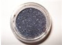
4. Licorice Stick SF A slate grey, our #1 seller!