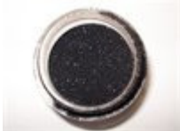
3. Black Bart SF A solid Black with minimal sparkle, great for everyday.