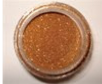
32. Candy Corn SF Light Golden Copper