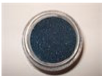
6. Berry Blast SF Dark Cobalt