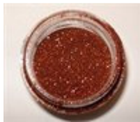
31. Sizzlin' Cinnamon SF Dark Copper