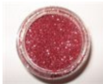
34. Bubble Gum F Fushia