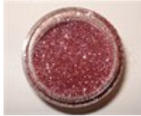
33. Double Bubble F Light Cool Pink in big chunky glitter