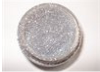
1. Jawbreaker SF A beautiful Silver

Sugars (#41-50, 55) Sugars - The Sugars are also a .008 x .008 grain size. However, the sugars are not solid colors. This type of glitter is a translucent, iridescent plastic grain which offers a hint of color. The Sugars are very difficult to use as liners and are actually intended to transform the eyelid or desired area of skin into a glitter. The Sugars are also incredible for stage performers, but look beautiful and are fun to wear as an everyday eye shadow.