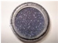
5. Ballistic Berry SF A beautiful blue-grey