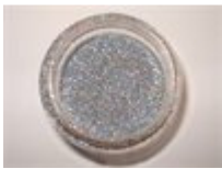
2. Confetti SF A hologram Silver