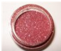
35. Tootie Fruitie SF A warm Rose