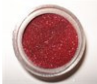
30. Candy Apple A dark Red