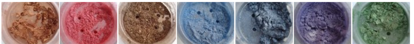
68 Sugar & Spice 69 Strawberry Swirl 70 Milk Chocolate 71 Peppermint 72 Pop Rock 73 Pixie Dust 74 Pistachio