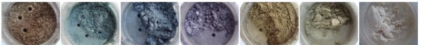
75 Caramel 76 Winter Green 77 Milky Way 78 Sorbet 79 Sweet Pea 80 Mint Julep 81 Sweet Cream